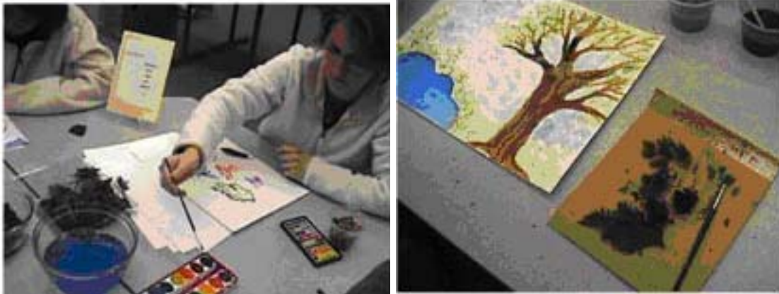
Figure 3a & b: Think Metaphor