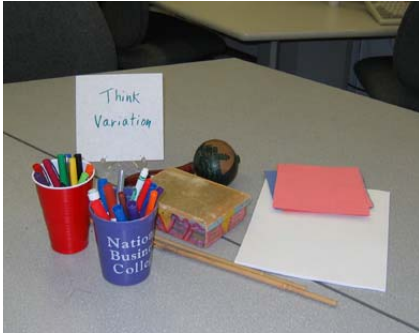
Figure 4: Think Variation