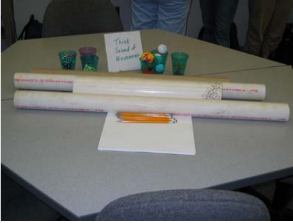
Figure 2: Think Sound of Movement