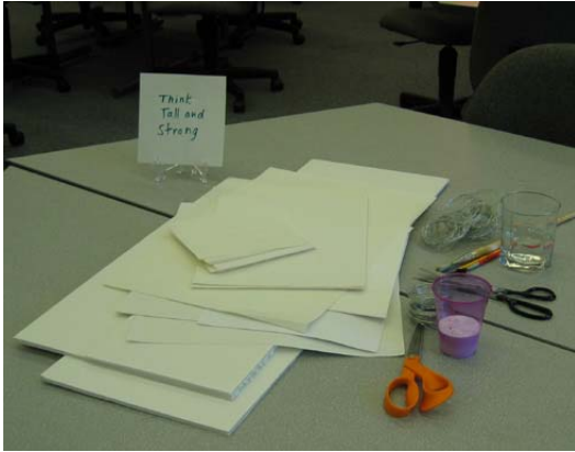
Figure 1: Think Tall & Strong

by incorporating provocations that welcome a playful attitude. Additionally, the group format will encourage solutions to open-ended processes that will be collaborative.