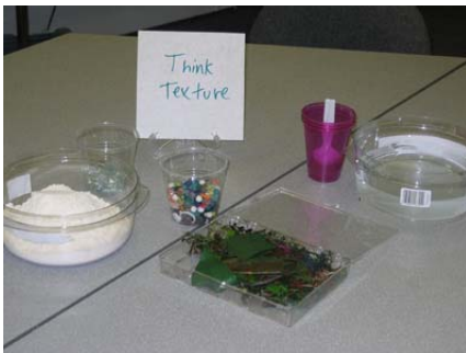
Figure 5: Think Texture