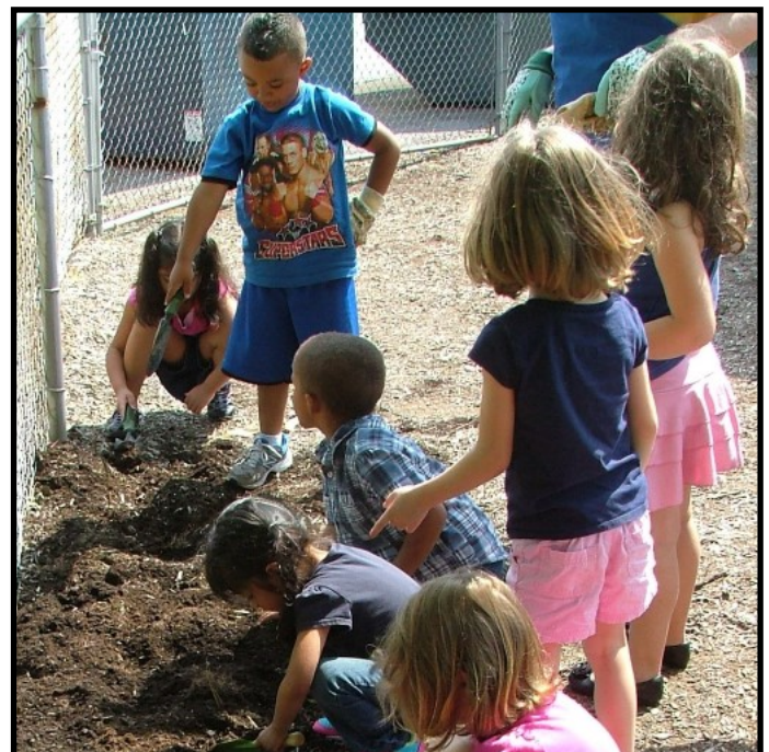
Children preparing a class garden