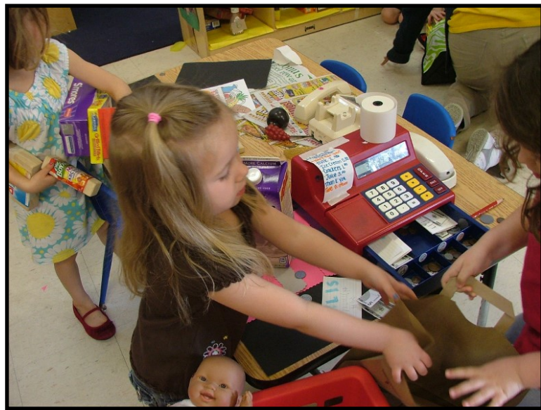
At the grocery store