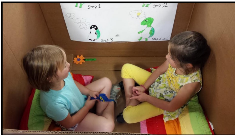
Children talking out a solution to a problem in the "Peace Corner"